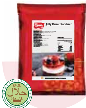
原味果凍粉 Jelly Drink Stabilizer

A natural gum mix used for creating transparent, refreshing jellies.