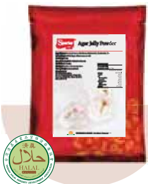
寒天吸得凍粉 減糖 Agar Jelly Powder Reduced Sugar

Smooth texture and pleasant mouthfeel, with less sugar to provide a healthier alternative