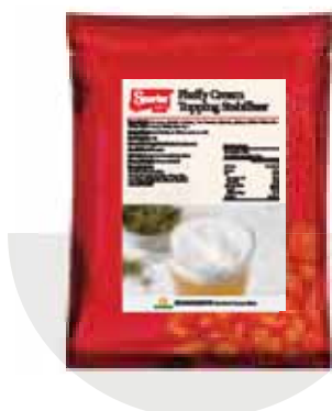
雲朵奶蓋粉 Fluffy Cream Topping Stabilizer

Fluffy Cream Topping Stabilizer can be only mixed with water and well whipping. The fluffy cream foam is dense and long-lasting.