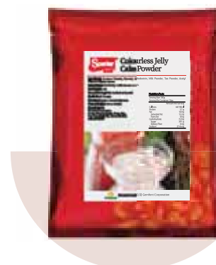
無色粉粿粉 Colourless Jelly Cake Powder

Easy to use for making bouncy transparent jelly cakes. It is colorless, so it can be easily combined with other materials to make Jelly cakes.