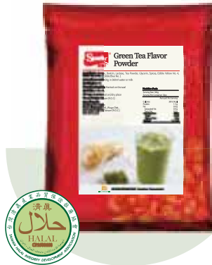
和風抹茶調味粉 Green Tea Flavor Powder

A perfect blend of matcha flavor, milk and sugar. It is the most popular choice for your Japanese taste sensation.