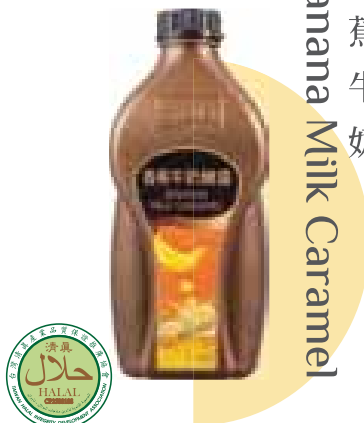
香蕉牛奶 Banana Milk Caramel

Rich and ripen banana notes combine the sweetness of caramel, creating a rich and creamy profile.