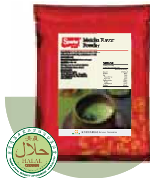
醇萃抹茶粉 Matcha Flavor Powder

Using only the finest ingredients and premium catcha flavors. Offers the most quintessential Japanese style tea experience.