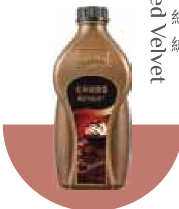
紅絲絨 Red Velvet

Inspired by red velvet chocolate cake. With chocolate and berries taste. Creating a rich and creamy profile. Offering a dazzling Morandi Pink color.