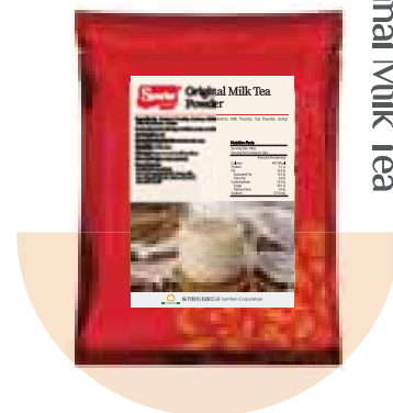
原味奶茶粉 Original Milk Tea

Made with selected raw materials, it is a classic milk tea with strong milk flavor.