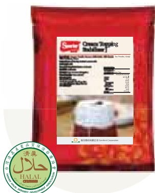
奶蓋粉 J Cream Topping Stabilizer J

This rich, easy to use, the quick whipped cream topping is perfect for enhancing the flavor and appearance of tea beverages and frozen treats.