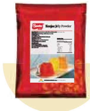
蒟蒻果凍粉 Konjac Jelly Powder

More elasticity and bounciness than average jelly, firmer in texture