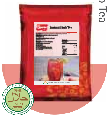
莓果茶 Herb Tea

Lightly sweetened, multi-layered taste. Made with selected herbal essence from top European suppliers.