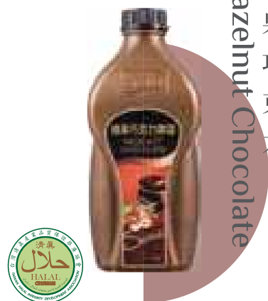
榛果巧克力 Hazelnut Chocolate

Chocolate and hazelnut are a classic pairing flavor, creating a rich and creamy profile.