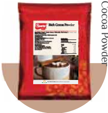
濃情可可調味粉 Rich Cocoa Powder

Made with selected raw materials, it is a classic milk tea with strong milk flavor.