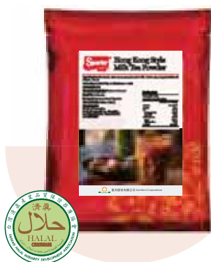
特濃奶茶粉 Hong Kong Style Milk Tea

Hong Kong-style milk tea with strong milk flavor and smooth taste. Classic richness and silky smoothness.